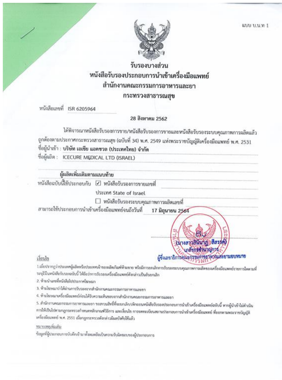
Exhibit 5.1(a) Regulatory Approvals

NOTE [REDACTED] NOTE 2 These guidelines may not apply in all situations. Electromagnetic propagation is affected by absorption and reflection from structures, objects and people.